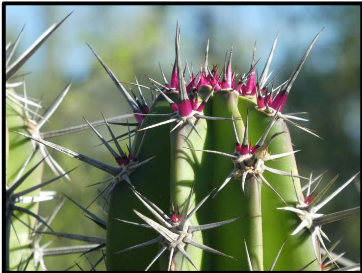
2 nd Place Scenery – Desert Bloom in Sonoran Desert