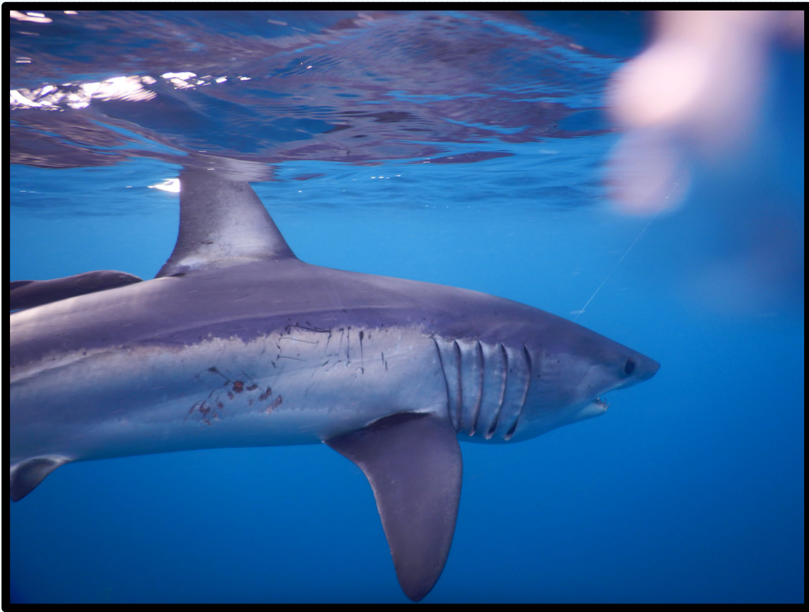
1 st Place Wildlife –Mako Shark