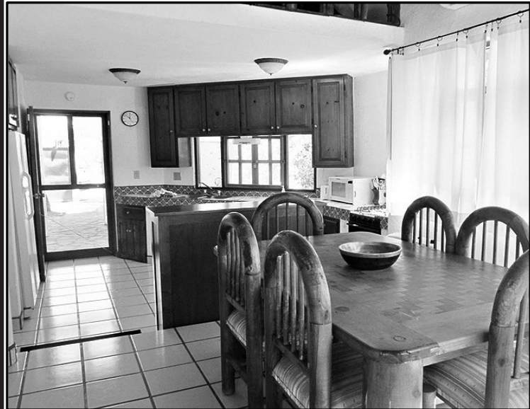
Casa 7 Dining Room and Kitchen

Fishing in the Loreto Bay National Marine Park can be exceptional for migratory dorado, yellowtail, sailfish, marlin and many other resident species.