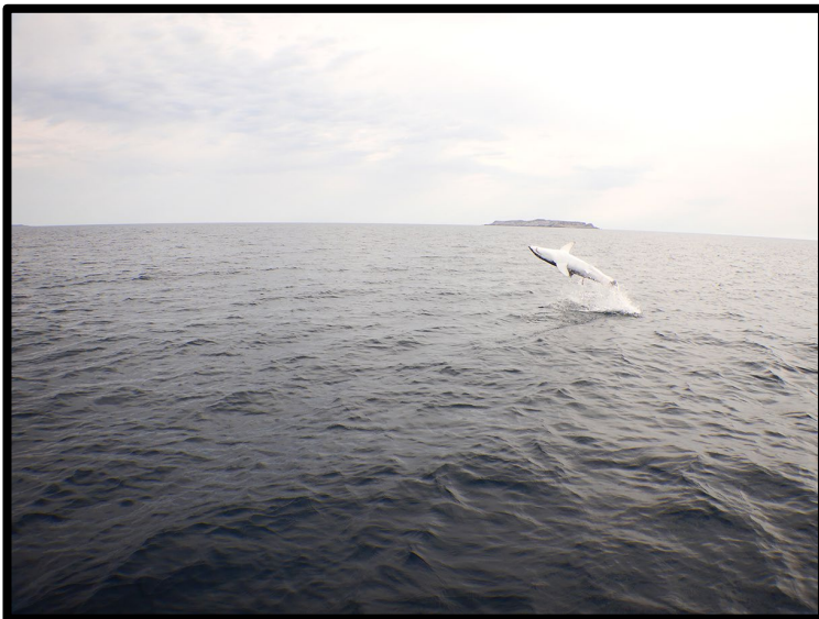
2 nd Place Action – 300lb Mako Shark