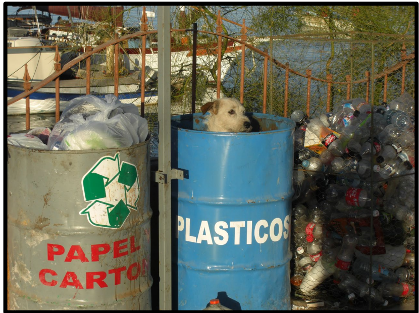
2 nd Place Pets – Dog Day Afternoon In Santa Rosalia