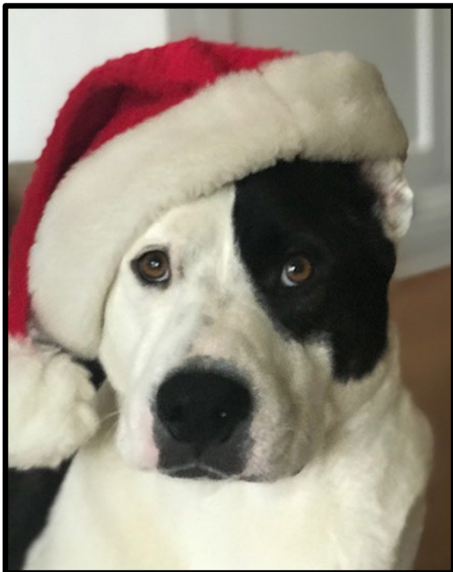
3 rd Place Pets – ARF Rescue Mattie in the Holiday Spirit