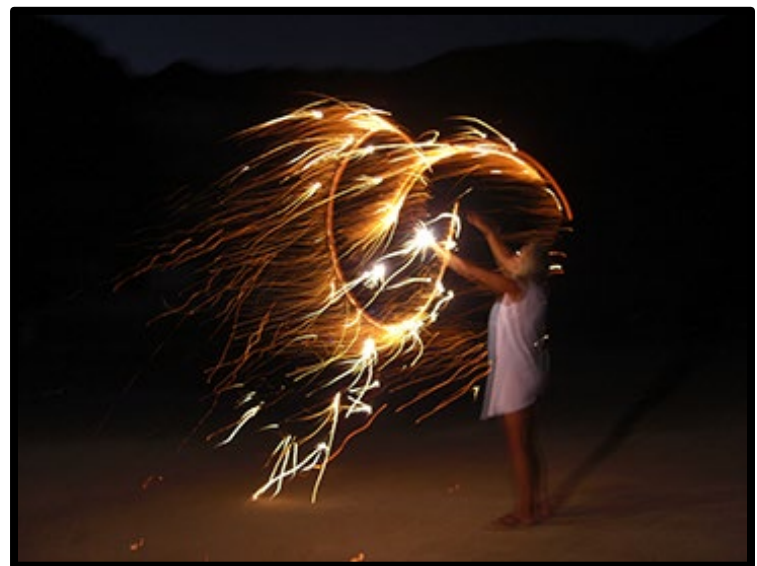
3 rd Place Action - 4 th of July