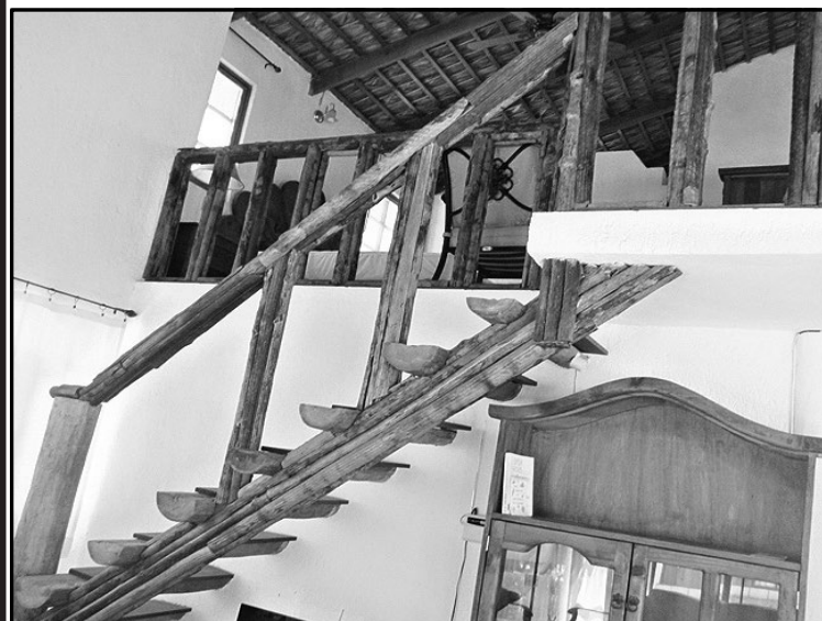
Casa 7 Living Room and Bedroom in Loft

Diving around the nearby islands is very popular, as well as kayaking and whale watching with several different species. Pangas can be chartered for a delightful day of picnicking and snorkeling. The area has lovely white-sand beaches with several adjoining reefs and numerous tropical fish. Several businesses cater to these activities.