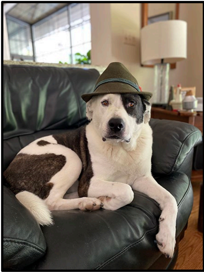
1 st Place Pets – ARF Rescue Mattie