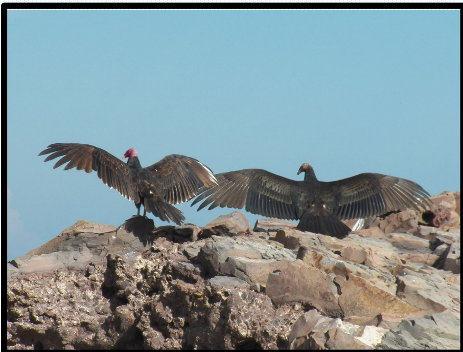
3 rd Place Wildlife – Sunning Vultures