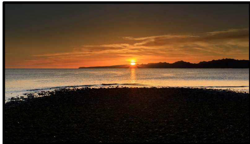
3 rd Place Scenery – Sunrise in Mulege