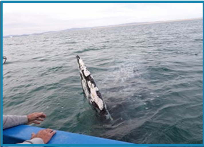
Gray whale waving to the group