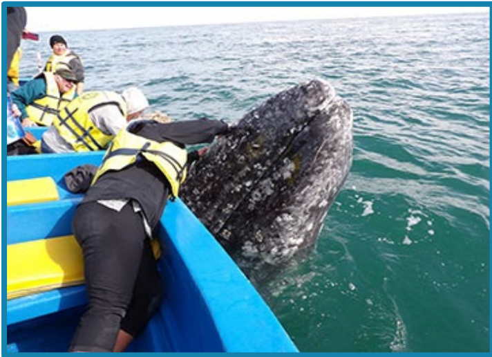
Gray Whale coming up to panga to be petted