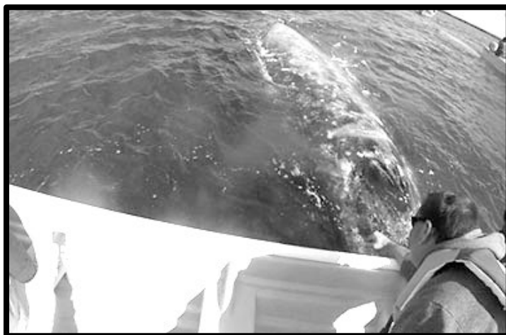
Gray whale coming up to panga to get petted