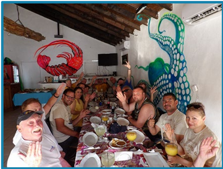
Tournament group at Lizetts for awards Dinner