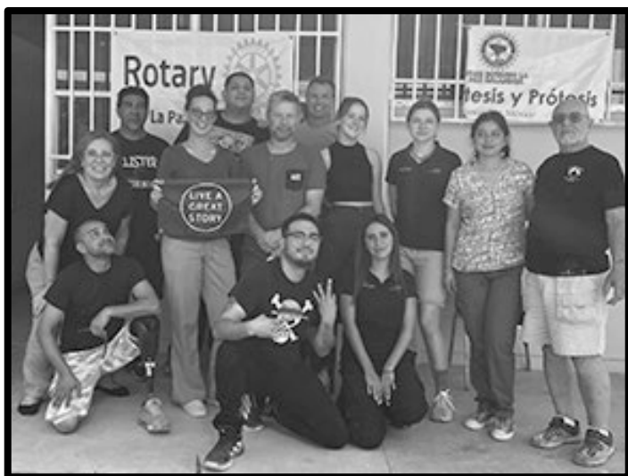
Volunteers' at this autumn's clinic