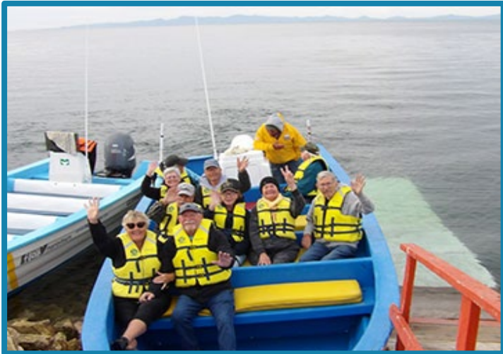
Group going out to see the Gray Whales