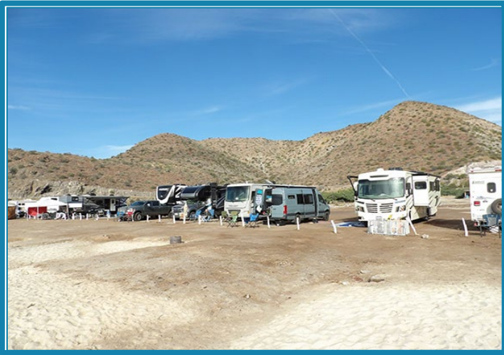
2023 Beaches and Whales Caravan camping on the beach