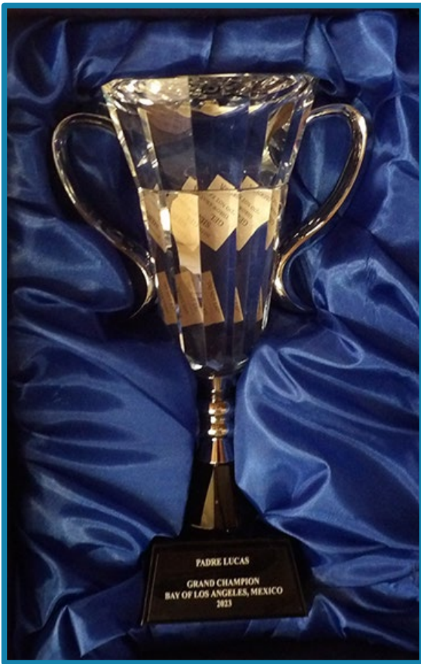
Grand Copa De Margarita went to Rich Doctor combined weight of 52.43lbs.