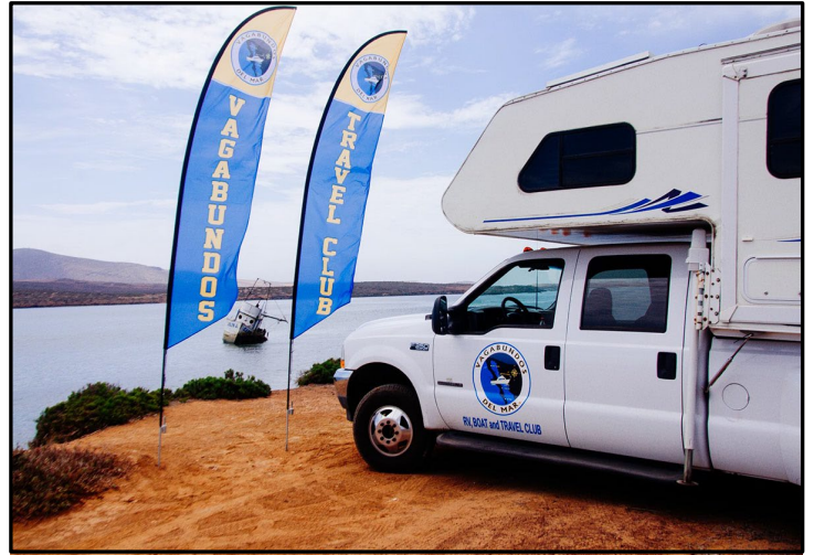
Vag Truck on Baja Direct Caravan