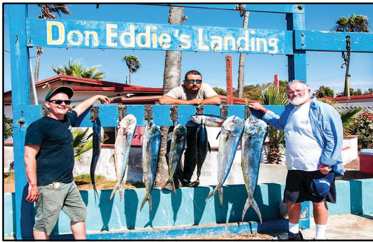
San Quintin Tournament