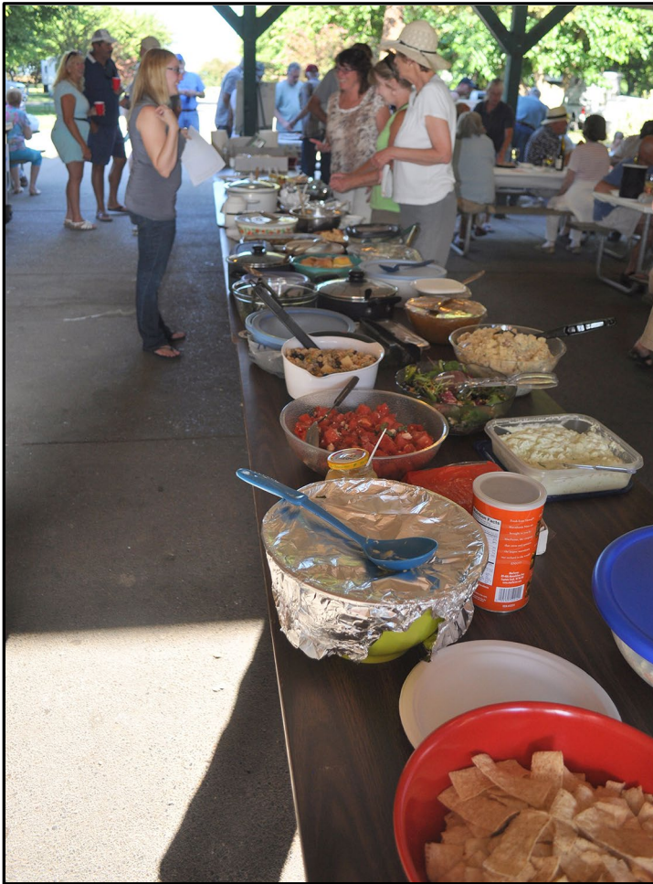
Pig Roast Potluck

Vagabundos del Mar 190 Main Street Rio Vista, CA 94571