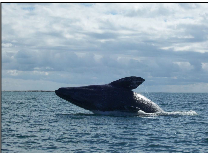
Gray Whale Breaching at Laguna San Ignacio