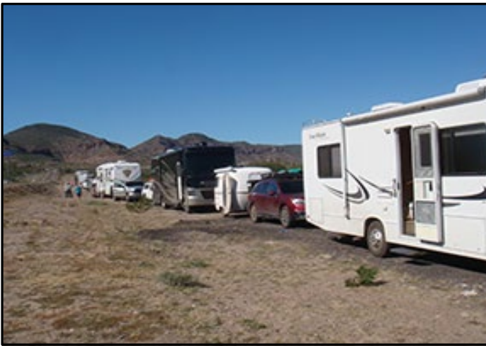
2017 Baja Direct Caravan taking a break