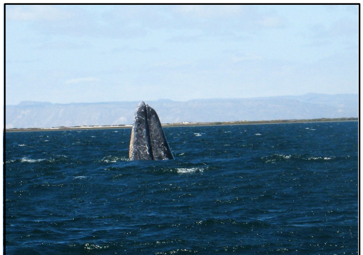
Gray Whale Spy Hopping at Laguna San Ignacio