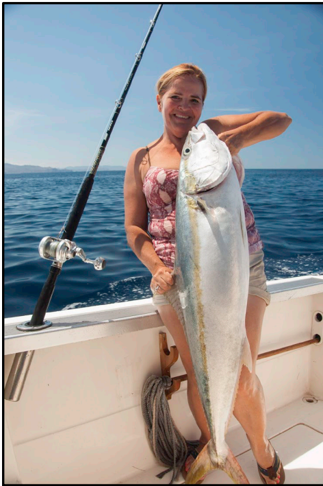
San Quintin Tournament