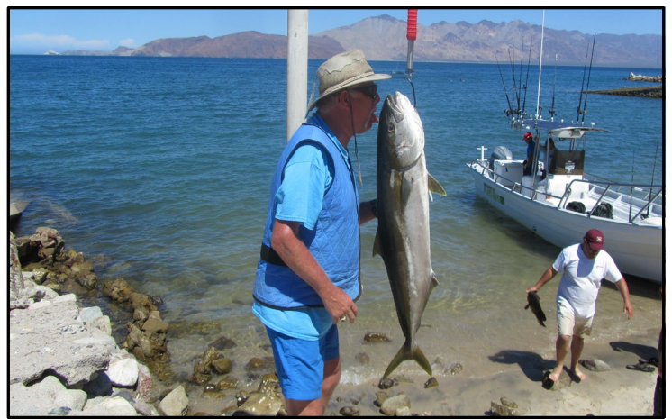
Padre Lucas Yellowtail Tournament Bahia de los Angeles