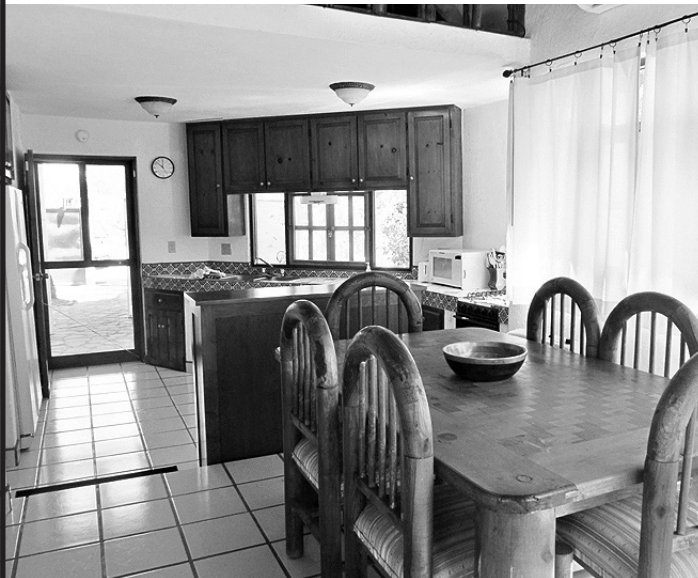
Casa 7 Dining Room and Kitchen