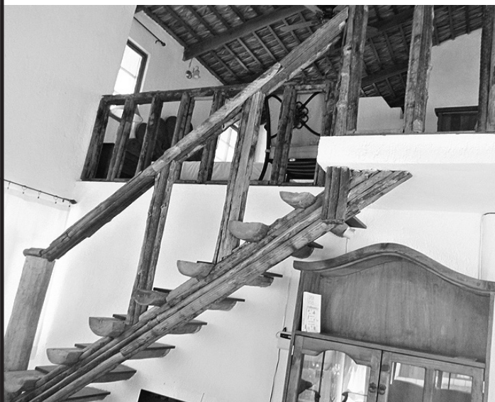
Casa 7 Living Room and Bedroom in Loft